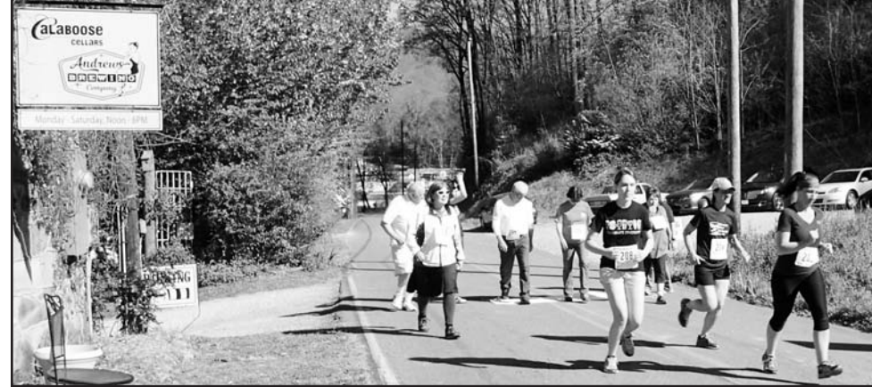
Participants in last year's 2K Water Run in Andrews, NC start the course in front of Calaboose Cellars. This year's fun run event is set for April 26th at 5 PM.

Spring is a splendid reminder of the wonder that nature beholds and we even dedicate one day in April to celebrating its bounties. The Hiwassee River Watershed Coalition is offering several ways to appreciate the great outdoors this spring and get to know your watershed at the same time.